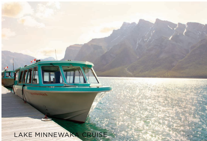
LAKE MINNEWANKA CRUISE