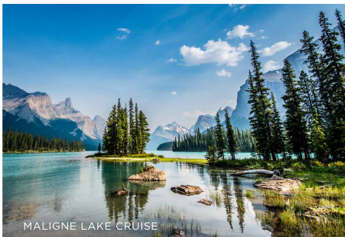
MALIGNE LAKE CRUISE