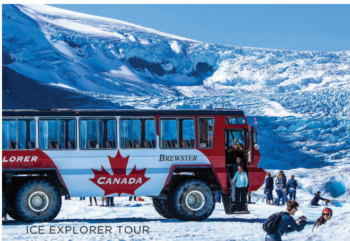
ICE EXPLORER TOUR