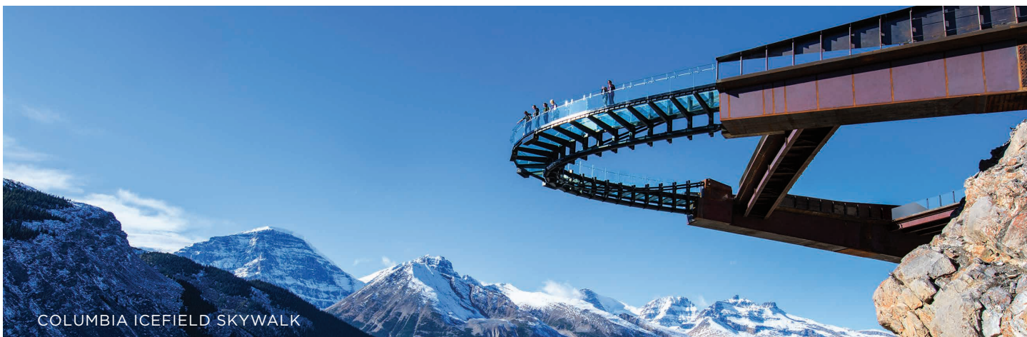
COLUMBIA ICEFIELD SKYWALK