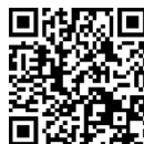
HILTON SUPERIOR DOUBLE